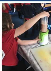
Year 1 using their designs to make a Super Smoothies.