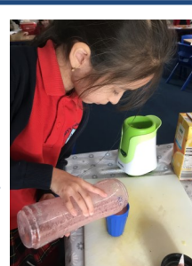
Pupils learnt about portion size, food hygiene and how to be safe when using equipment.